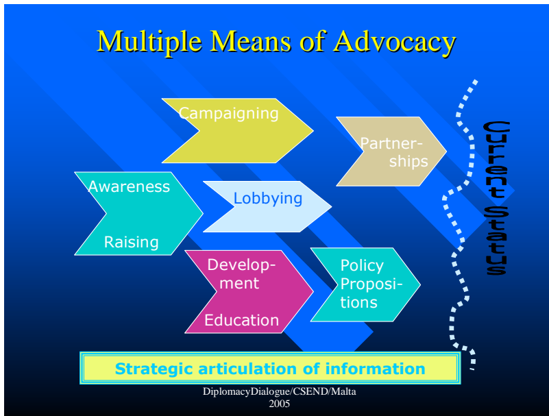
Figure 2: Multiple Means of Advocacy

Figure 2 depicts the ingredients of an advocacy campaign to influence the PRSP process in favour of inclusion of employment and the Decent Work Agenda.