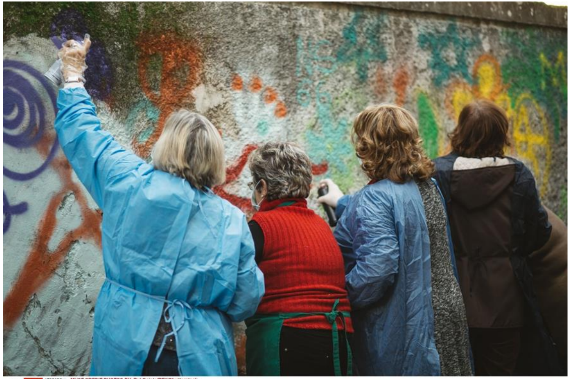
#USA State #USA This State is a creative workshop teaching served at 10 sensor of steer. Libbon Tortugal, May 2015 Jurita se Frequesia de Carricis (parish), Lisbon FULL BODY. http://www.resdeatures.com/nanolinkigthr Laza 65 is probably the world's most interesting graffiti garrig. The new urban workshops sirive to break down starootypes and ageism by teaching street at 10 sensor of stares.