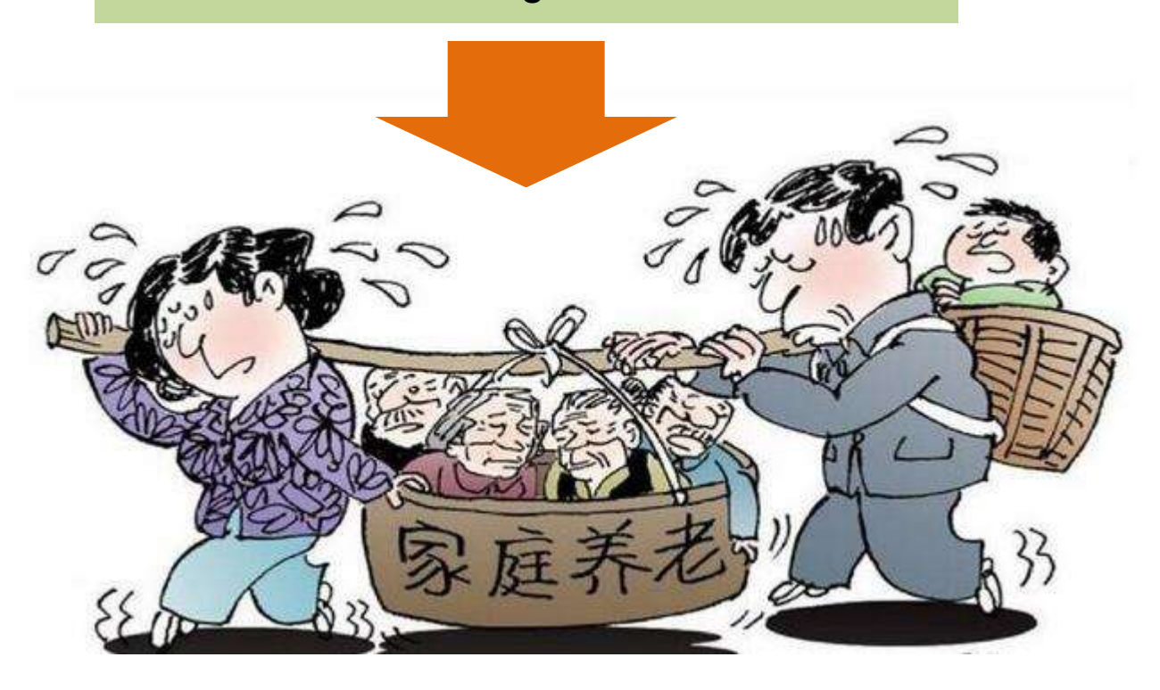
The '4-2-1' family structure

Family planning policy, population movements and intergenerational relations